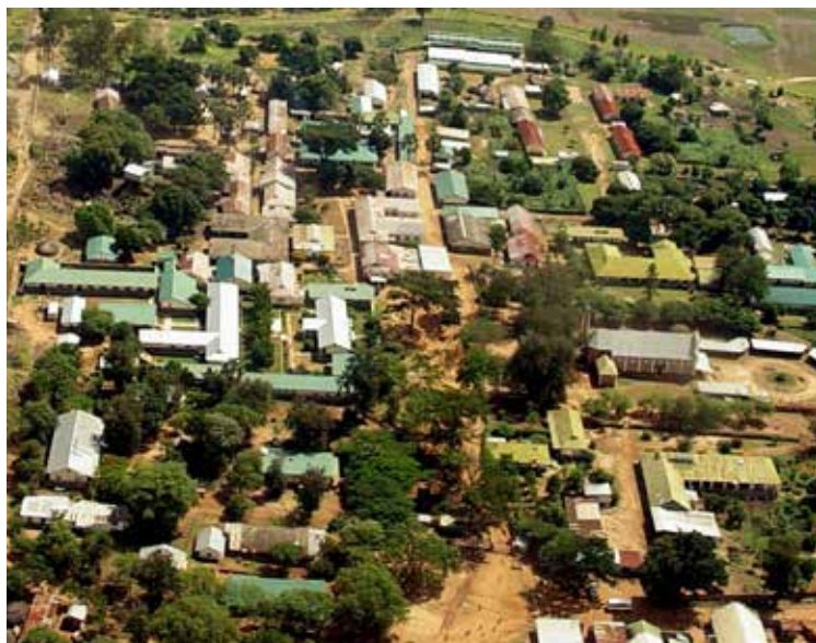
An aerial view of Kalongo Hospital and Mission

hospital staff and the Missionaries were accused of supporting the guerrilla war and told in no uncertain terms they were all confined from that moment to the compound of the hospital and the Mission. No one was to leave (otherwise they would risk being mistaken for a rebel and being shot); and no-one would be allowed to enter, under any circumstances. After a week under effective 'house arrest' the Missionaries were summoned to a further meeting on February 7th 1987. They were informed by the Brigade Commander that the Military High Command in Kampala had ordered the closure of the hospital and Mission with the evacuation of everyone there. The Commander was