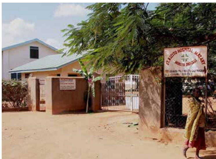
The entrance to St. Kizito Hospital in Matany

village of Iriir on the border between Karamoja and Teso.